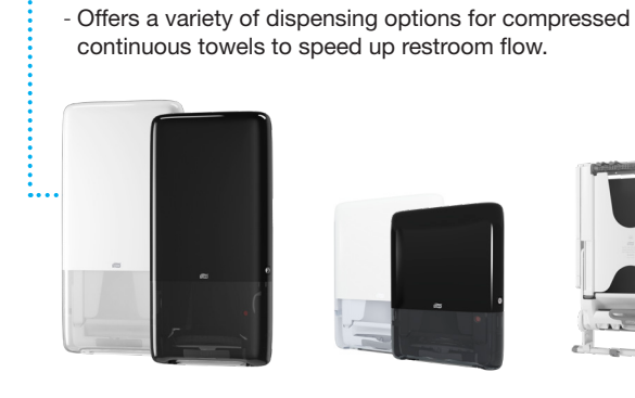
Tork PeakServe Item # 552520 (white) 552528 (black)